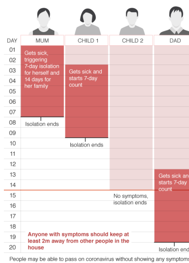
What happens if someone in your family gets sick?

If anyone at school (child or adult) shows symptoms of Covid-19, they will undertake a test - we will refer them for the test. If this test shows to be positive, all children and adults within that child's class will need to self-isolate for 14 days.